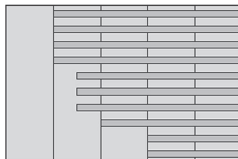
Table 4.1 (page 70)

The shadow falling across the upper part of the brick-wall mirrors Table 4.1 in the report, which shows the main reasons given by crime victims as to why they are reluctant to seek legal remedies. The lower shadow illustrates Table 4.2 which outlines the reasons given by complainants for not persevering with their court cases.