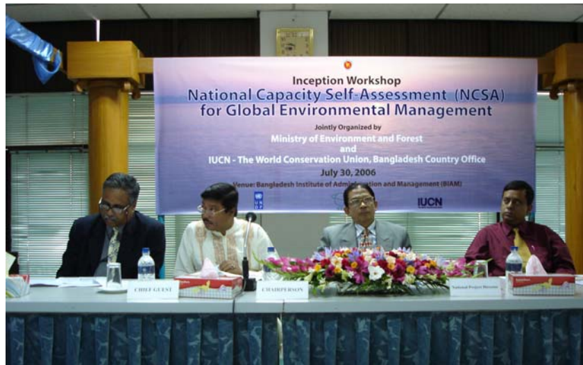
Fig.1: Inaugural session of NCSA Inception workshop

An inception workshop was held on 30 July 2006 in Bangladesh Institute of Administration and Management (BIAM), Dhaka, Bangladesh. Hon'ble Ex-State Minister for Environment and Forest Jafrul Islam Chowdhury was present as the Chief Guest in the inaugural session while Jafar Ahmed Chowdhury, Ex-Secretary, Ministry of Environment and Forest presided over the session. The representative of the concerned ministries/divisions, government departments/ agencies, research organizations, academics from the universities, civil societies, NGOs, development partners, experts, environmental practitioners, press as well as electronic media and other stakeholders were present as participants at the workshop. At the onset, Dr. Ainun Nishat, Country Representative of IUCN - Bangladesh Country Office welcomed the audience and Monowar Islam, Project Manager of NCSA presented a short brief on NCSA project. Tariq-ul-Islam, Joint Secretary, MoEF and National Project Director (NPD) of NCSA offered vote of thanks at the end of the inaugural session.