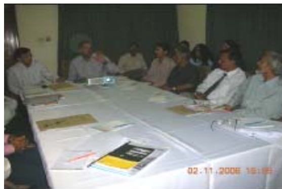
Fig.2: Thematic Group meeting of NCSA

Prior to each meeting a resource person was selected to prepare a theme paper as per the ToR of the TG and it was then distributed to the participants for their perusal. In the TG meeting the resource person presented the paper and the expert members gave their input which were then considered to prepare the final version of the Thematic Report.